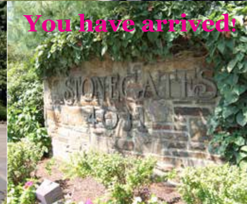
You have arrived!