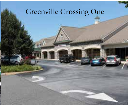
Greenville Crossing One