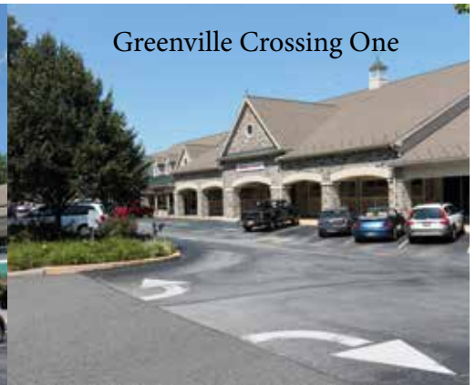
Greenville Crossing One