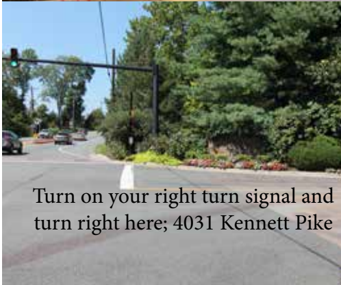
Turn on your right turn signal and turn right here; 4031 Kennett Pike