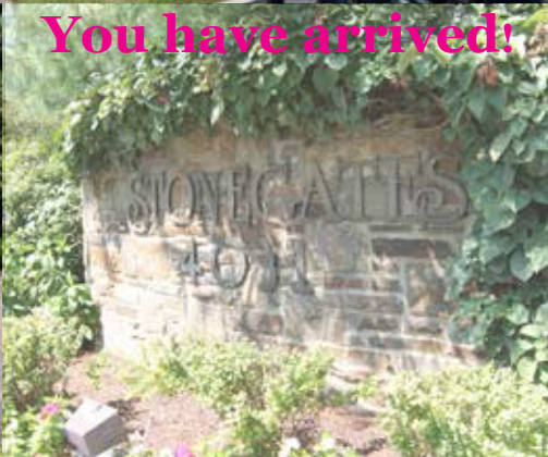
You have arrived!