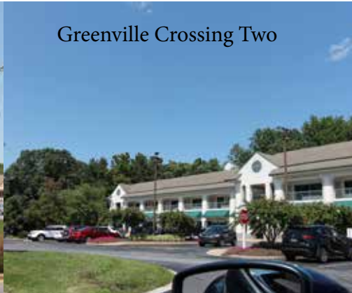
Greenville Crossing Two