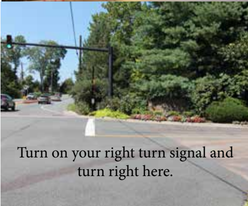
Turn on your right turn signal and turn right here.